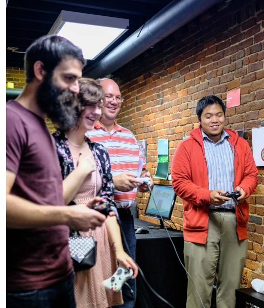
Attendees at the 2017 Kentucky Fried Pixels Launch Party – See page 8 for more information about this event!